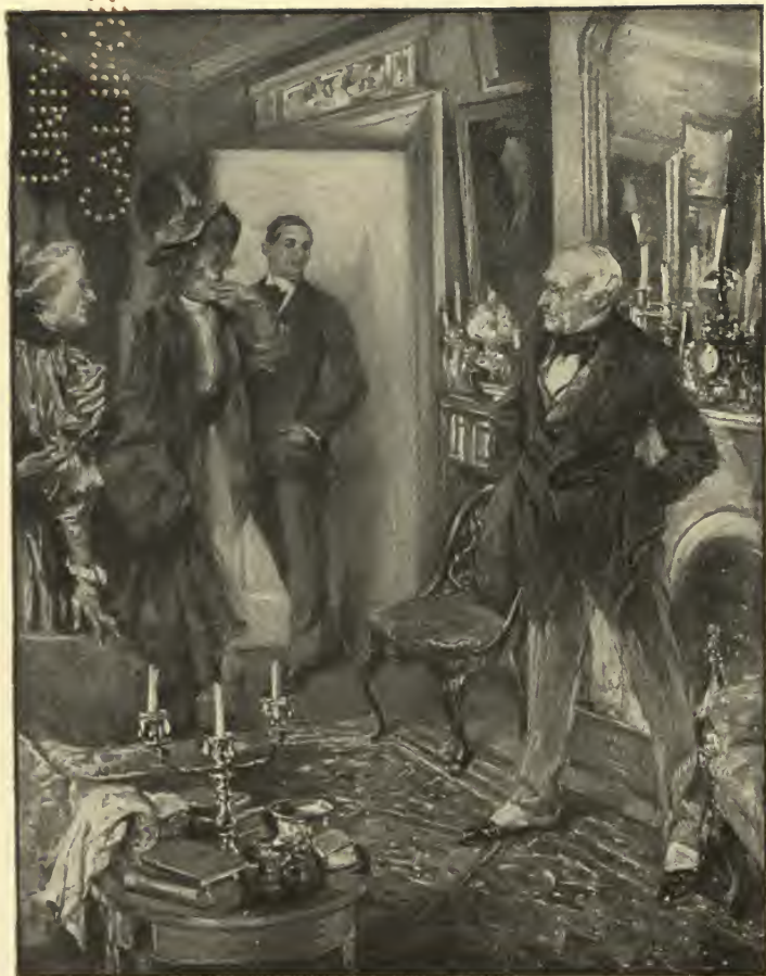
She sent another kiss flying through the air.